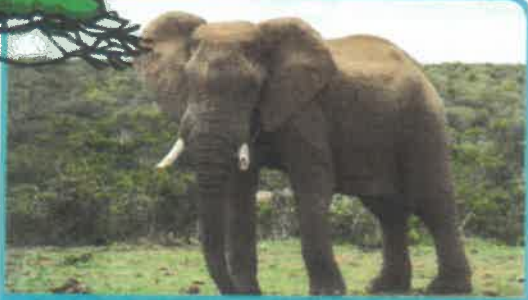
an African elephant

There are three simple ways to tell whether the elephant you are looking at is an African elephant or an Asian elephant. You can look at their ears, the shape of their head and their tusks.