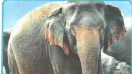
an Asian elephant